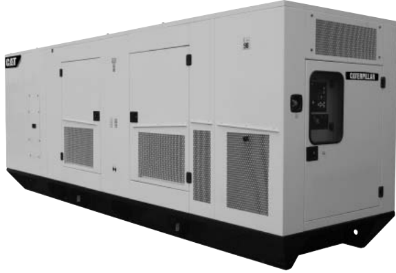
Picture shown may not reflect actual package.