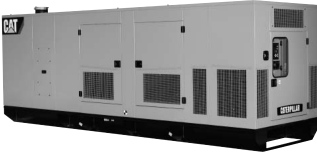
Picture shown may not reflect actual package