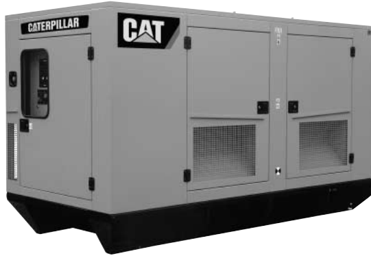
Picture shown may not reflect actual package.